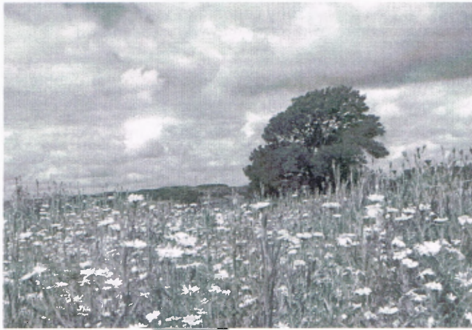
August – Wildflower Meadow