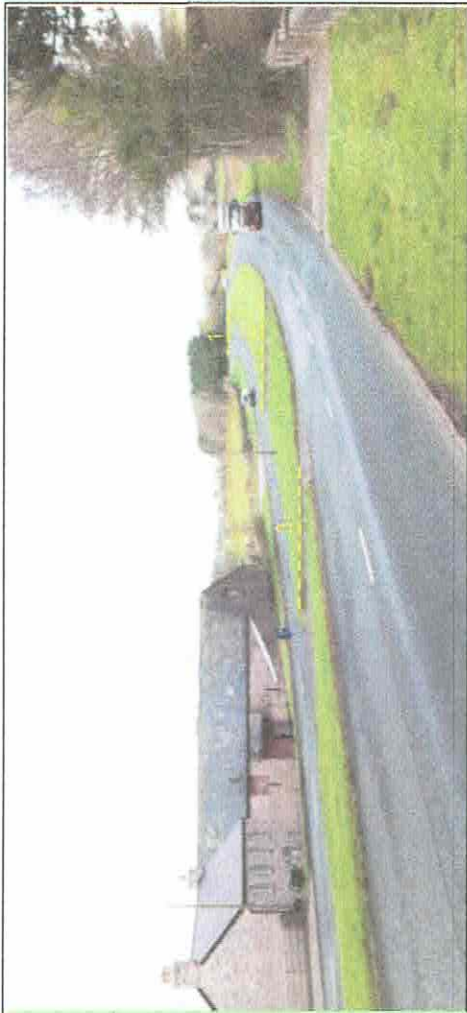
Photo from Point A - Looking north west in direction of Brecon. Crossing 1 at The Old School and 2 and 3 at Millbrook are indicated by yellow lines. No road markings or signs visible to oncoming traffic.