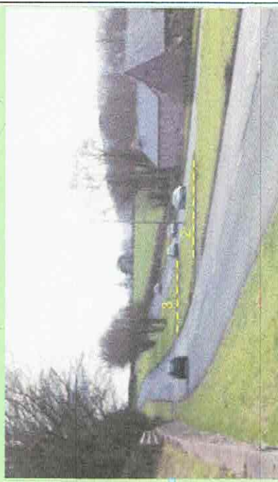
Photo from point B - Looking south east at Millbrook in direction of Abergavenny. Crossings 2 and 3 are indicated by yellow lines.